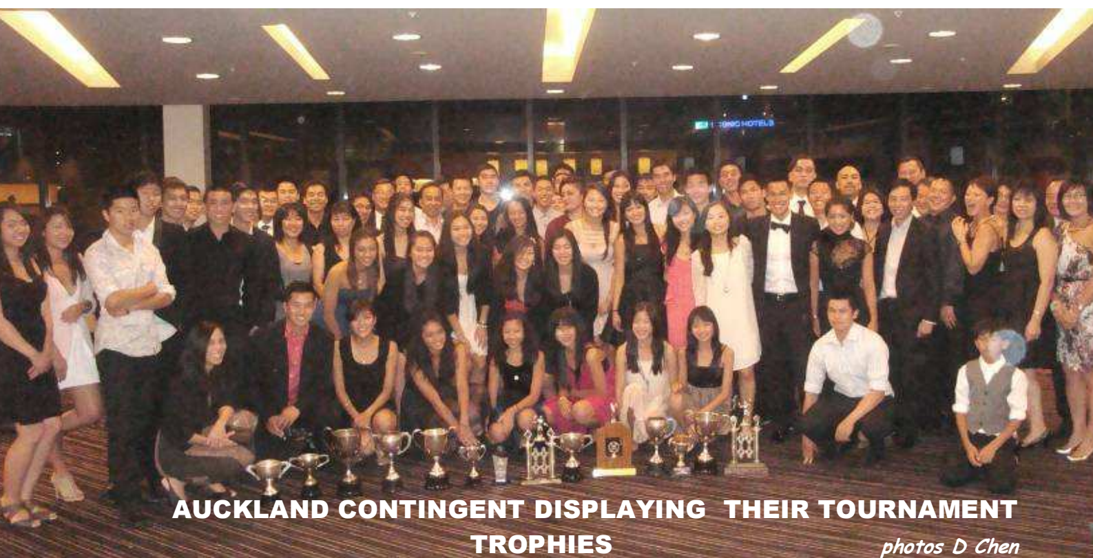
AUCKLAND CONTINGENT DISPLAYING THEIR TOURNAMENT TROPHIES

P O Box 484 Shortland St, Akld.1140 -- www.nzchinese-akld.org.nz -- Winter Newsletter 2012