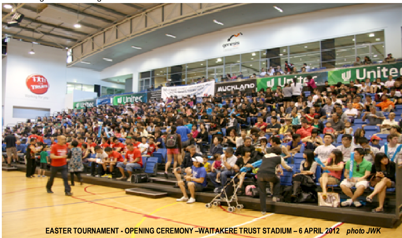
EASTER TOURNAMENT - OPENING CEREMONY -WAITAKERE TRUST STADIUM – 6 APRIL 2012

Pp NZCA Ak. Easter Tournament Organising Committee